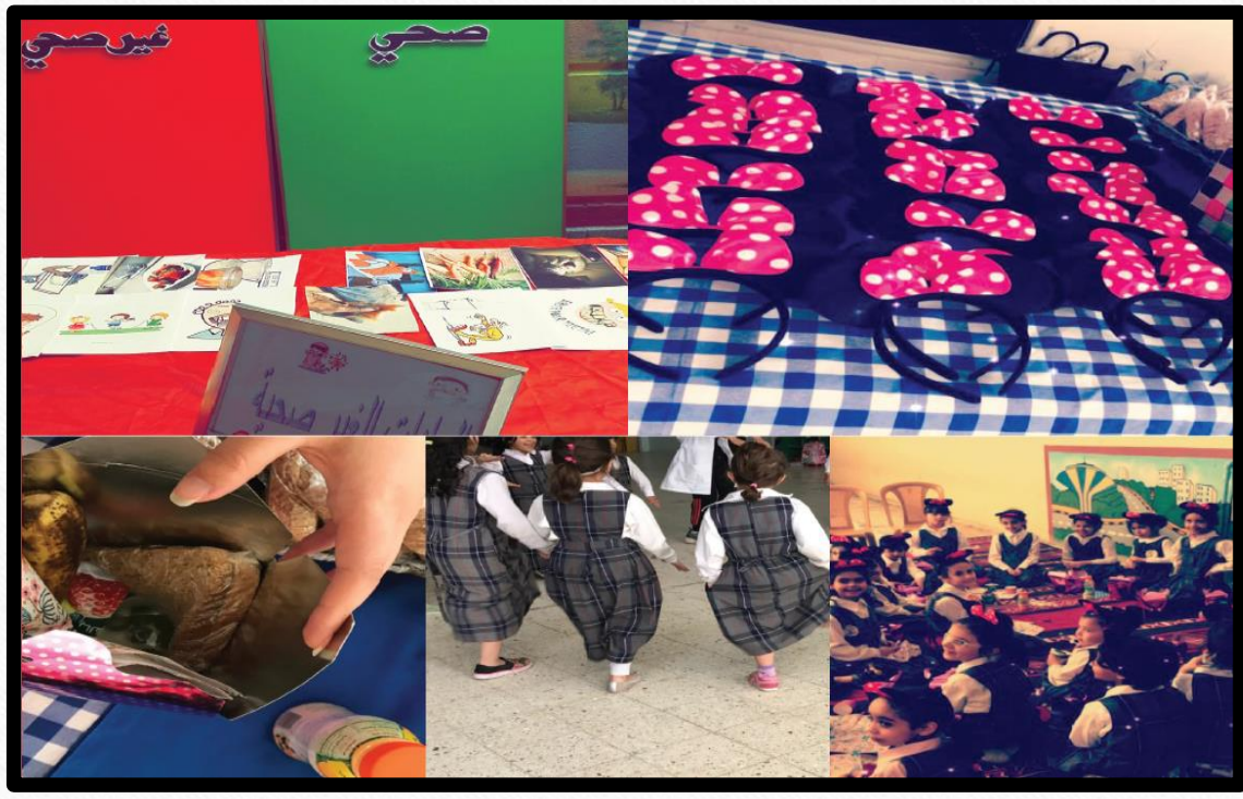
Be Smart And Choose Your Food